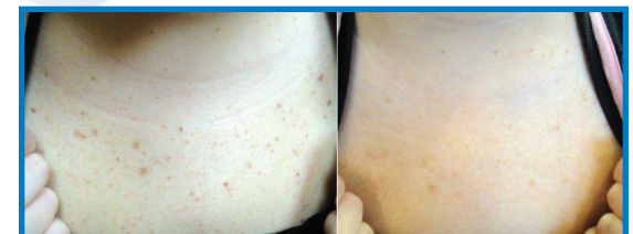
Actual QnA Patient