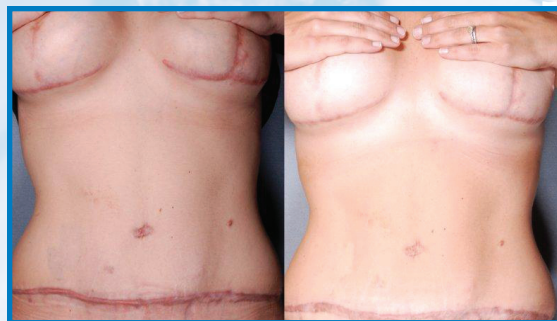
Actual QnA Patient