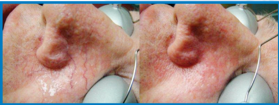
Actual QnA Patient