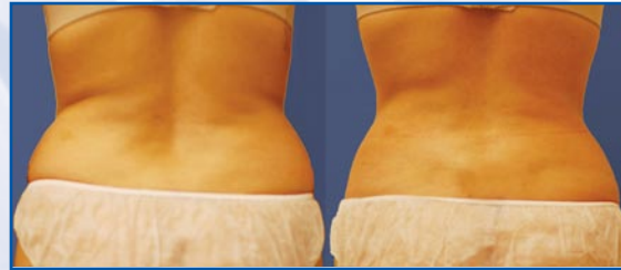
1 Week After Procedure