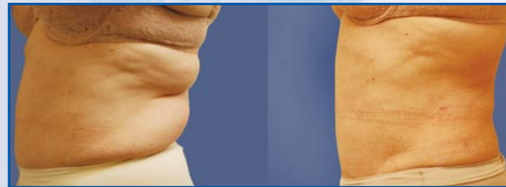
2 Weeks After Procedure