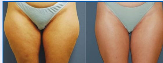
11 Weeks After Procedure